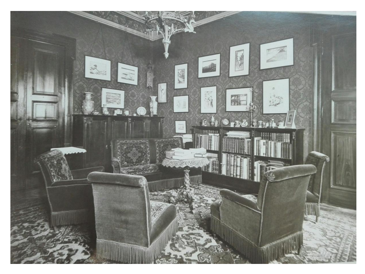
Fig. 2: Studio with Japanese prints, Palazzo Morpurgo, Fototeca, Civici Musei di Storia ed Arte, Trieste, inv. 33177