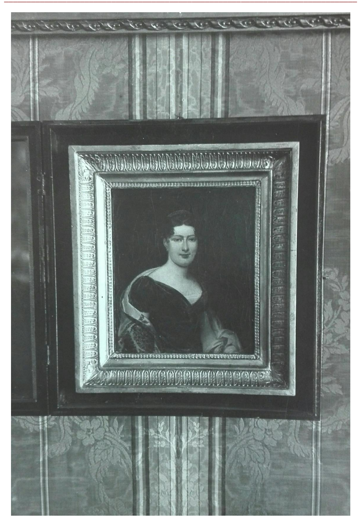
Fig. 3: Jean-Auguste-Dominique Ingres (attributed), Female portrait, Palazzo Morpurgo, Fototeca, Civici Musei di Storia ed Arte, Trieste, inv. 33193